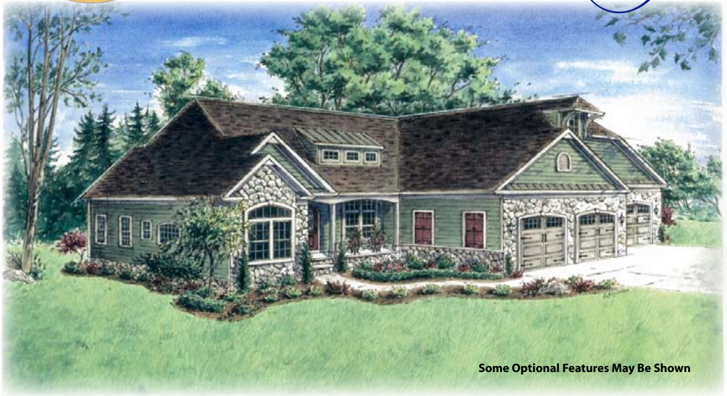
Some Optional Features May Be Shown

This 2,679 square foot executive ranch is being built using the latest “green-building” techniques for superior energy efficiency and savings.